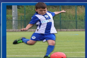
DEAN TRUST WIGAN

16TH FEBRUARY - 19TH FEBRUARY 9AM - 3:30PM