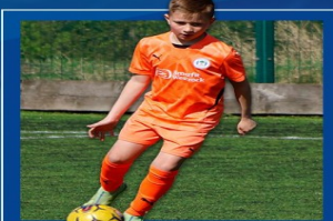
ATHERTON HIGH SCHOOL