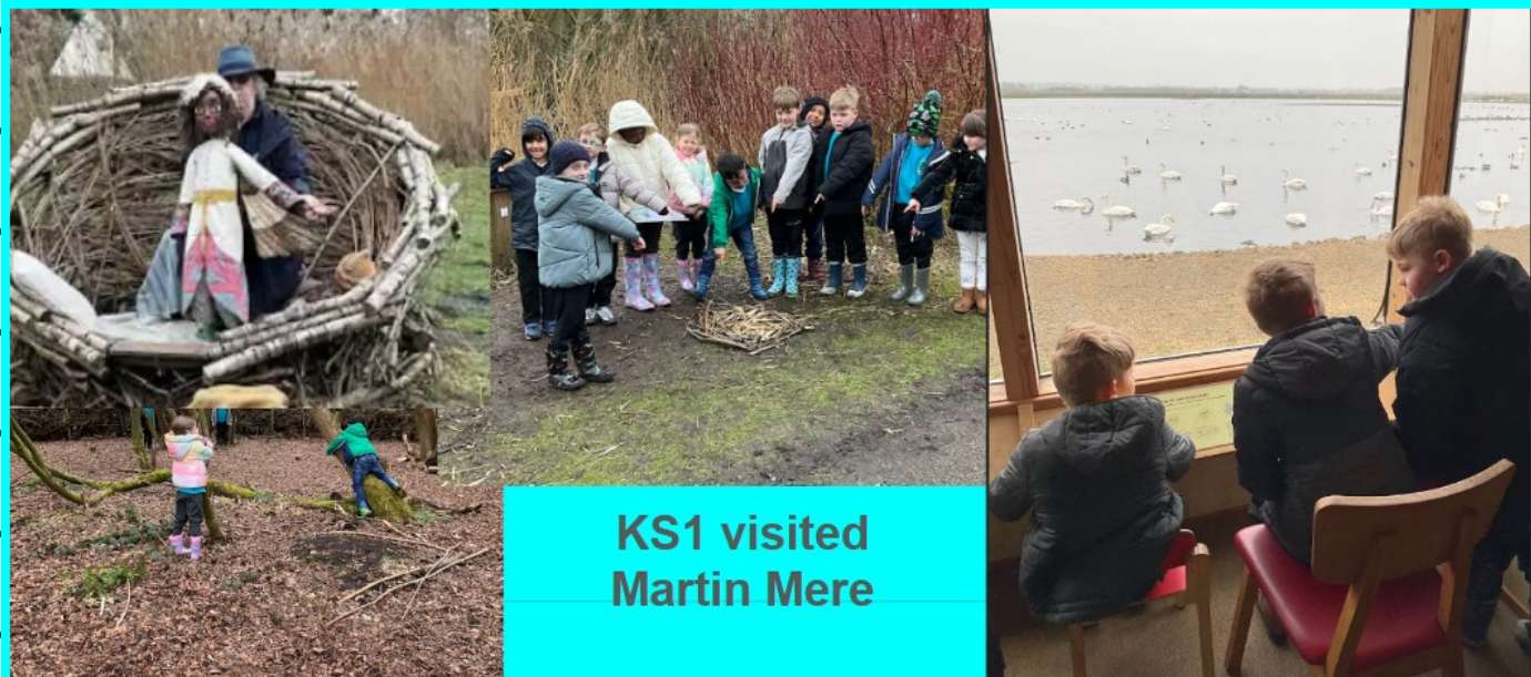
KS1 visited Martin Mere